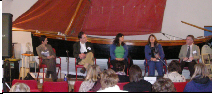
The Panel at the KCF 2007 Seminar